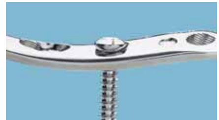
Cortex Screw Ø 3.5 mm