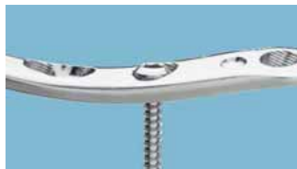
Cortex Screw Ø 2.7 mm