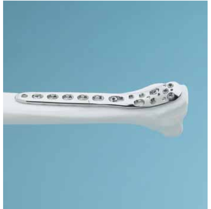
Plate features combined with AO technique create an environment for bone healing, expediting a return to optimal function.