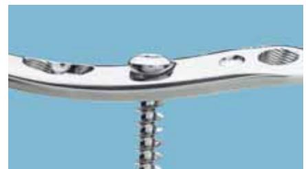
Cancellous Screw Ø 4.0 mm