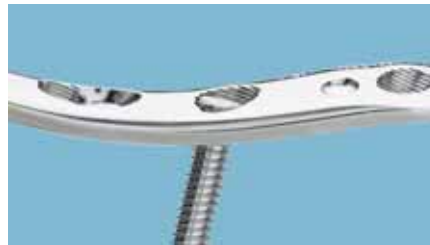
Locking Screw Ø 3.5 mm