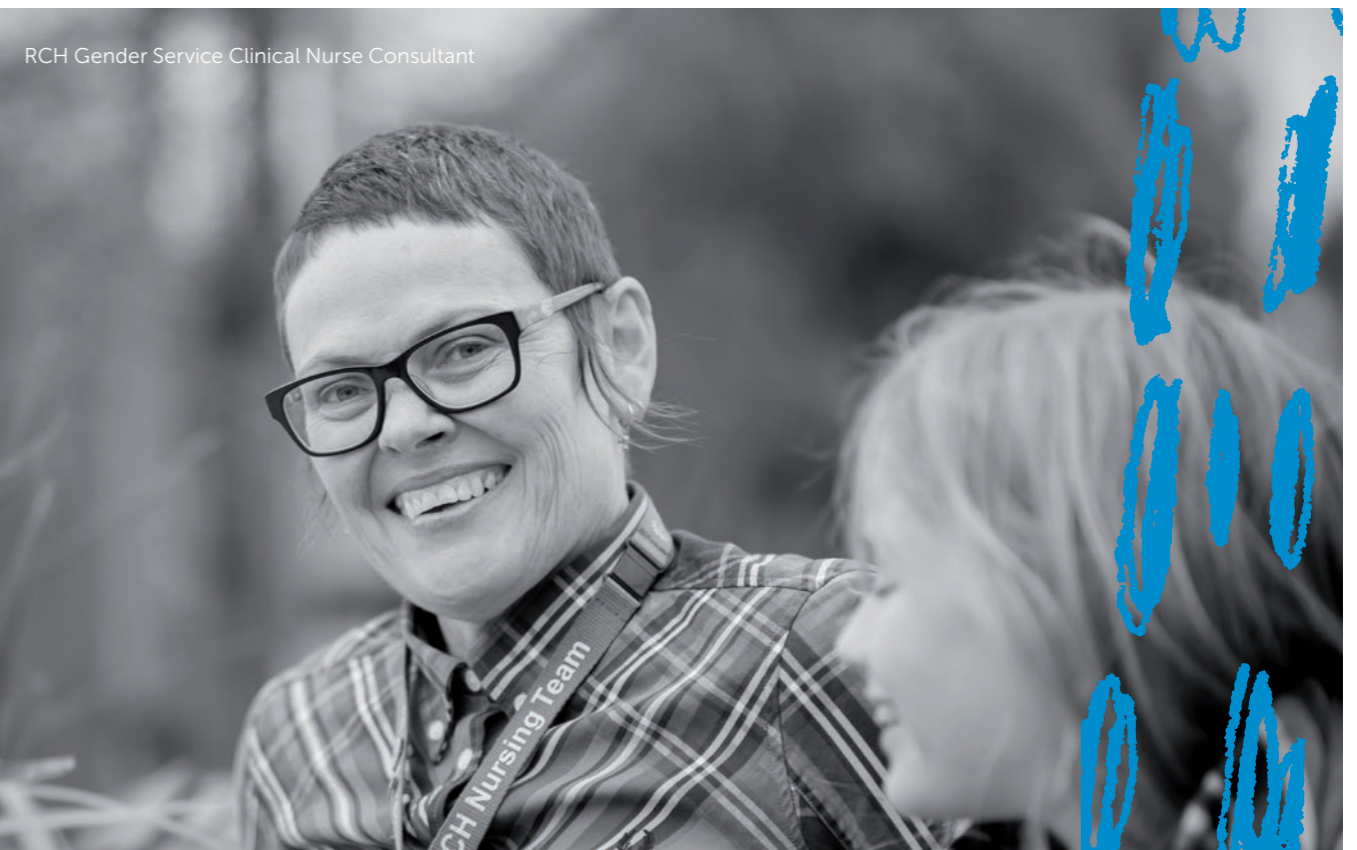
RCH Gender Service Clinical Nurse Consultant