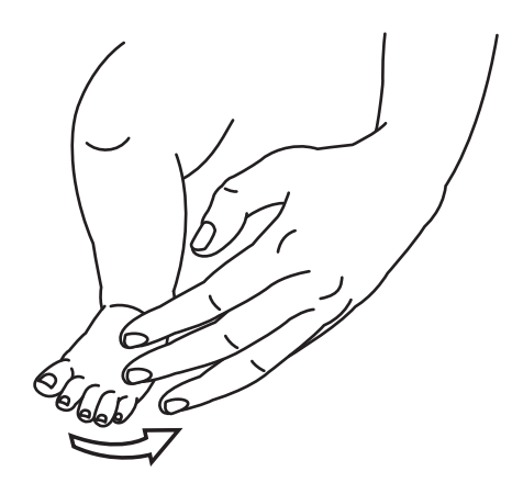
Exercise 2. Gently stroke the outside and front of baby's foot and lower leg.