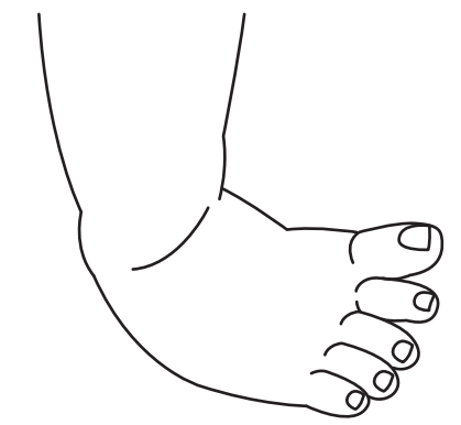
Figure 1. Uncorrected clubfoot

After treatment the baby will have a foot with essentially normal function. Children with clubfoot are expected to lead a normal active life; however, they must be monitored throughout growth. Strict adherence to the brace-wearing regime is the best way to avoid relapse and maintain the correct position of the foot.