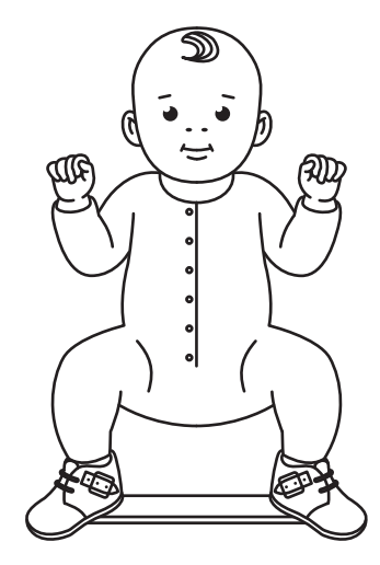
Figure 3. Foot abduction brace