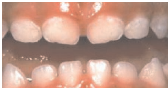
Figure 1. White spot lesions www.pc.maricopa.edu

One of the first signs of decay are small white lesions running along the gum line (Figure 1). These lesions represent the early signs of decay as the enamel is being demineralised but the surface remains intact. At this stage it is possible to reverse the process by promoting remineralisation and preventing cavitation.