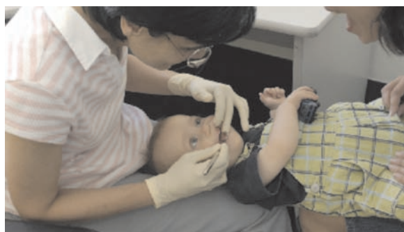
Figure 2. Lap-to-lap position (Country Kids, 2004)

The recommended approach to look at the infant or toddlers mouth is the lap-to-lap position (see Figure 2.). In all visits it is important to look for a healthy oral cavity with pale pinky, moist gums, that do not bleed on brushing and that are free of unusual ulcers and/or sores. After the eruption process starts (around 6 months of age), it is important to observe the presence of plaque, white spot lesions (Figure 1.) and dental decay.