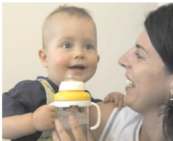
(Country Kids, 2004)

Dummies should not be dipped in honey or any other sweet drink.