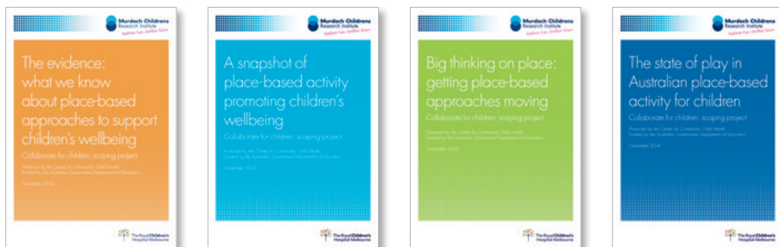
Figure 1: Collaborate for children: scoping project publications

This report provides recommended action to accelerate place-based efforts to improve children’s wellbeing and address inequalities in Australia. All publications can be downloaded from www.rch.org.au/ccch .