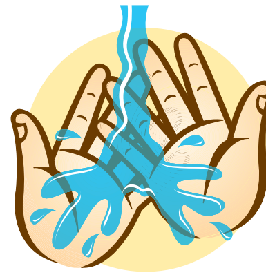
1 Wet your hands