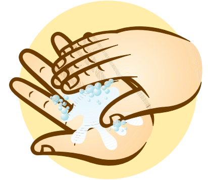
2 Apply solution and scrub for at least 15 seconds