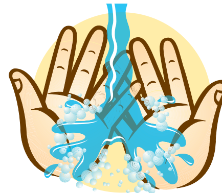
4 Rinse your hands