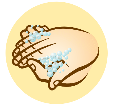
3 Scrub back of hands, wrists, between fingers and under fingernails