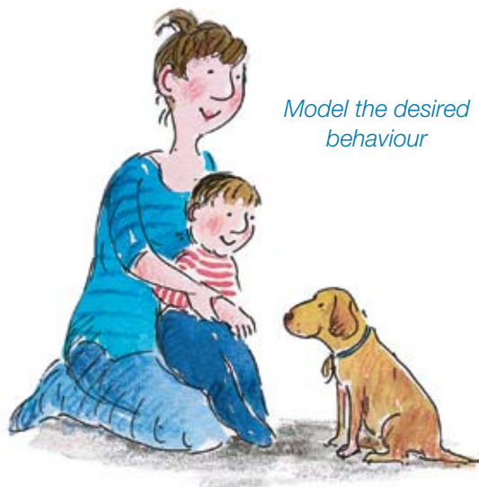
Model the desired behaviour