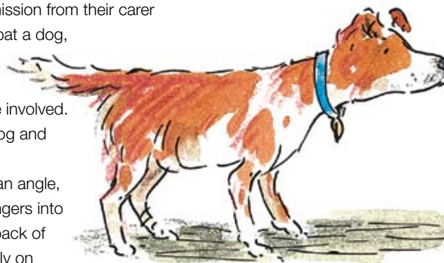
Stand still if approached by a strange dog