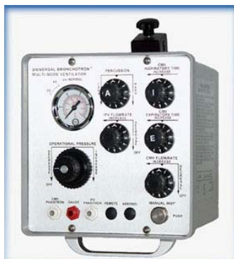
High Frequency Ventilator