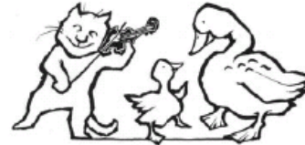
A Parent-Child Mother Goose Program