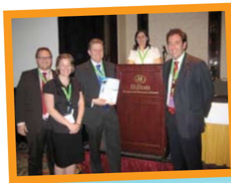
Presenter from Peter Mac at the conference.

The feedback from our presentations was excellent and we are now planning an assault on the next meeting in Venice in 2011.